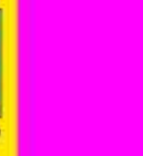
Urveshi Singh UPSEE-302