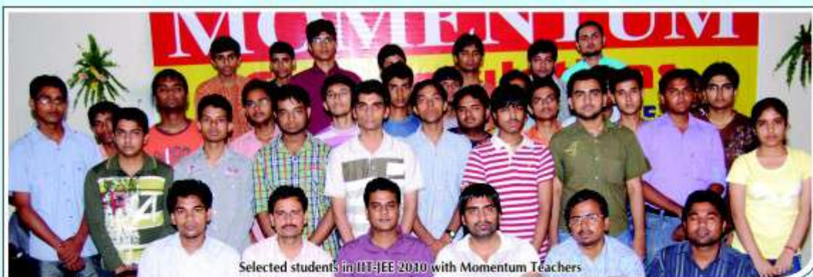
Selected students in IIT-JEE 2010 with Momentum Teachers