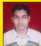
Siptain Lari IIT AIR-4179