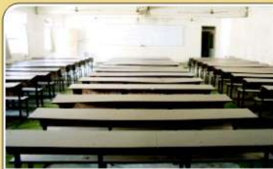
Air Conditioned Lecture Hall