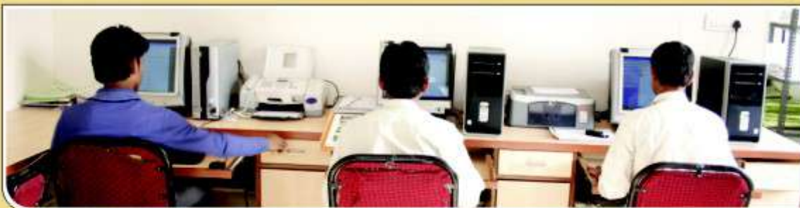
Computer Room (Study Material Development)